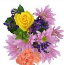
PURPLE FLOWER BOUQUET